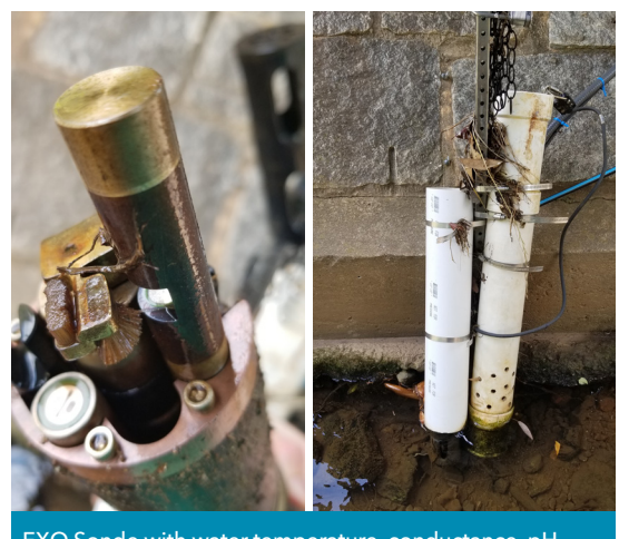
EXO Sonde with water temperature, conductance, pH, DO, turbidity, chlorophyll, and phycocyanin sensors.