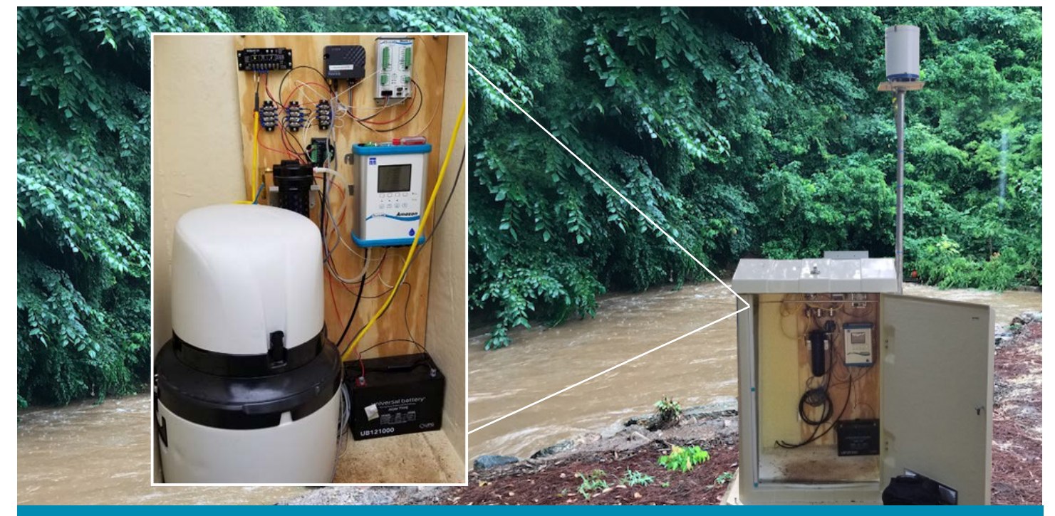
A continuous water monitoring station installed along Tanyard Branch equipped with: an Amazon water level Bubbler and EXO multiparameter water quality sonde, Storm Datalogger, and ProSample sampler.