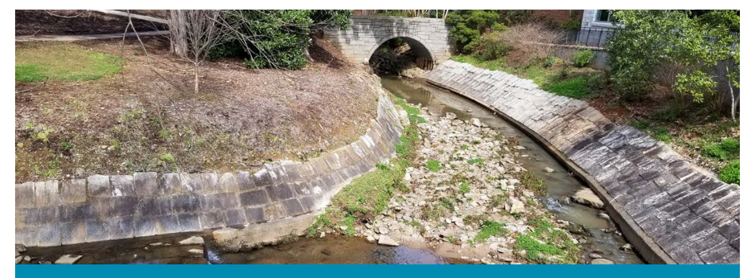
Tanyard branch is channelized for the majority of the reach resulting in similarity to a stormwater pipe.

Specific conductance always rose during these discharge events, too, which is extremely important as far as a determination of source. According to the team, a normal Georgia Piedmont region stream has conductance in the range of 40-80 uS/cm. Wesley noted, "When it gets over about 100 µS/cm, we start to say that something is going on here. But this stream typically measures around 180 uS/ cm. Then, when it spikes, it will go up about 10 uS/cm and then come back down. So it is concerning to us as to where that might be coming from - the baseline is high and then it spikes even higher."